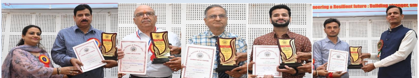
Engineers while receiving Mementoes from the Chief Guest on 56 th Engineers' Day